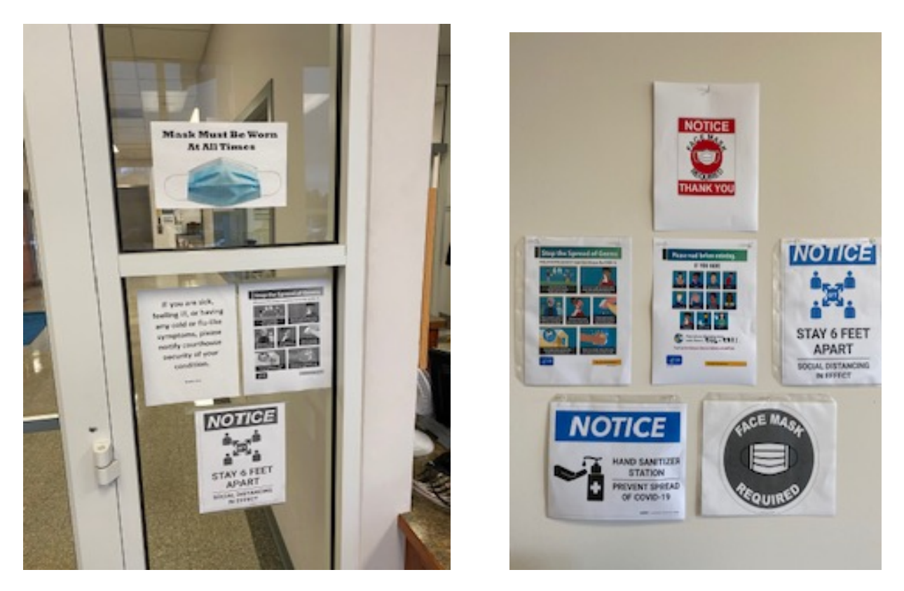
Sample Notices at Entrances Hallways and Waiting Areas