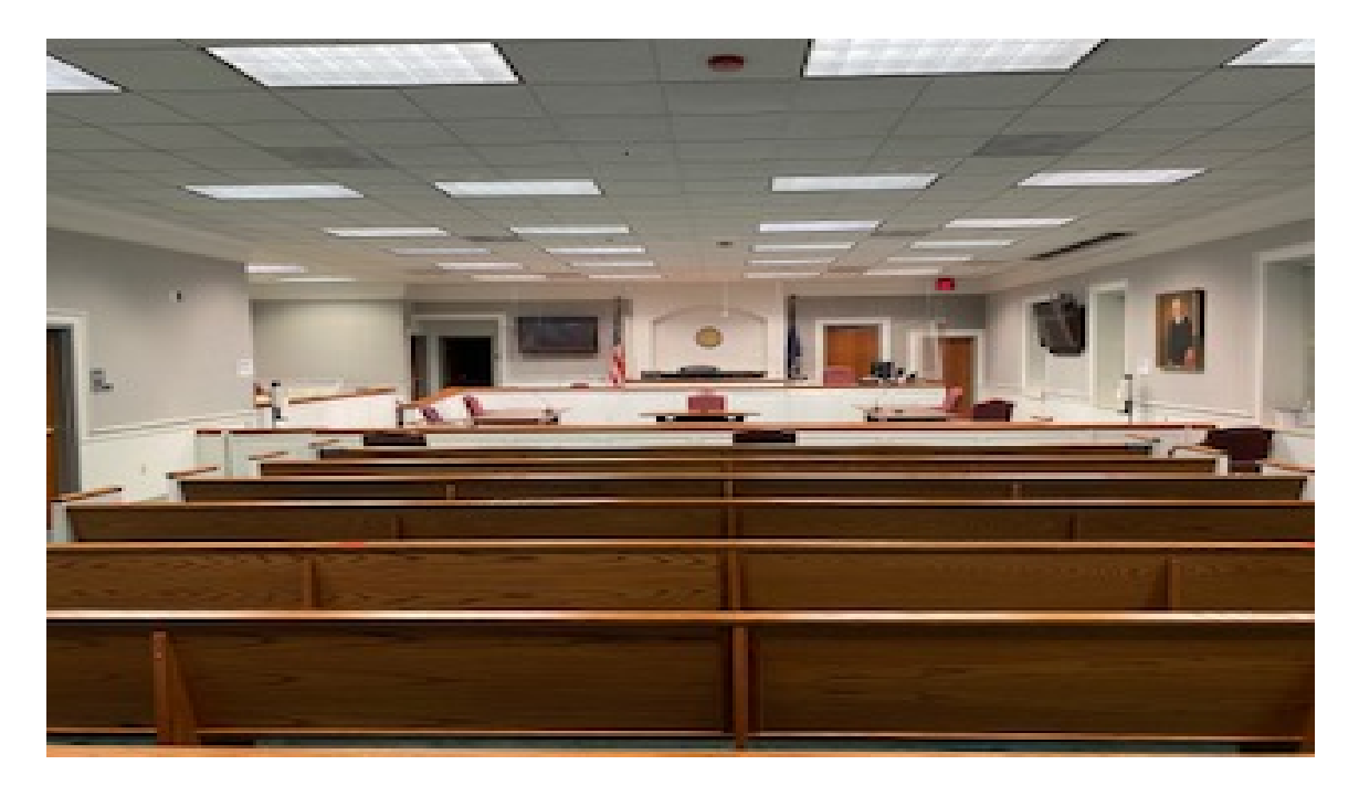
Circuit Courtroom View from Back