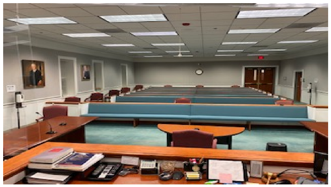
Circuit Courtroom View from the Bench-Red Tape Marks Seats