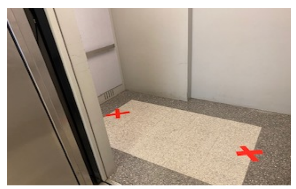
Elevator Occupancy Notice and Floor Markings