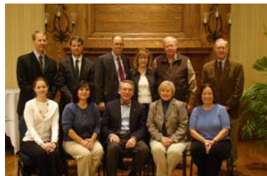
2008 Best Practice Court Mentor Judges