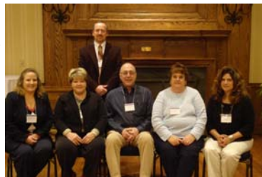
Smyth Best Practice Court Team Led by Judge Charles Lincoln

tailed the implementation of Systems of Care in Winchester/ Frederick and the training that has been offered to local stakeholders to educate them about this program.